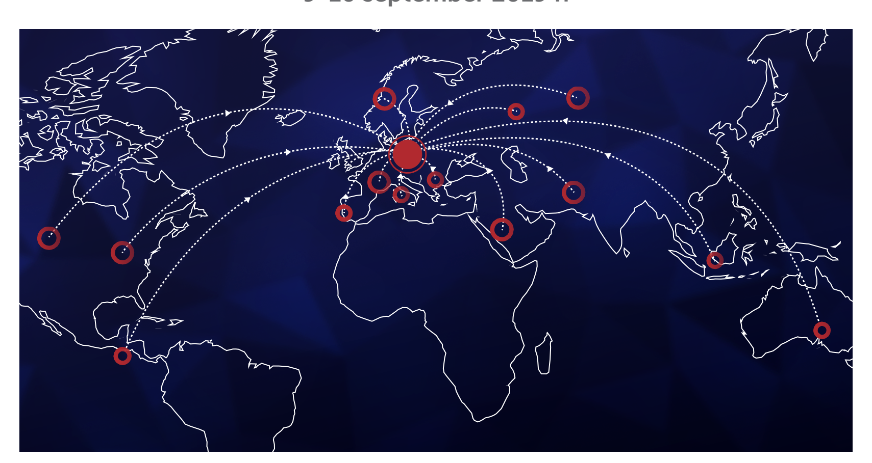
Warsaw 9-10 september 2019 r.

Regional Development through International Cooperation